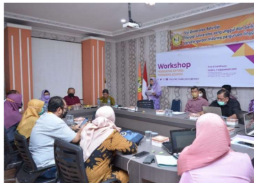
Fig. 1 Training Activities/Workshop on making Scopus indexed articles at Baturaja University

This training program is intended to provide knowledge and skills for lecturers at Baturaja University in writing Scopus indexed articles. This activity was organized by the Faculty of Engineering and Computers, Baturaja University on December 11, 2021 with the following activities: