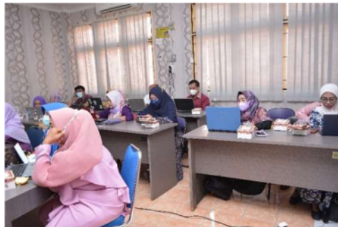
Fig. 2 The Atmosphere during the training