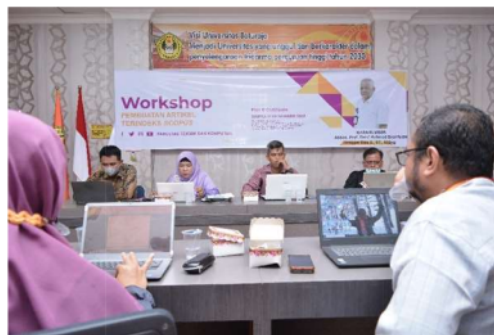
Fig. 4 Training activity