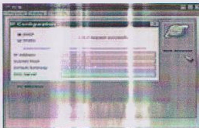
Figure 1: DHCP of Group VLAN 2

there is demarcation access the network and only use the IP address private that is class C, so that range IP address can be guessed easily and all activities computer (host) in network can be in peeping. This situation results in Vocational middle condition. At school less be maximal in its network processing and representation of Vocational cause inefficiency High School, what is at its practical tataran results the koneksi is often broken and lower the penetrating nya of Vocational TIK High School of Country 1 Lempuing.