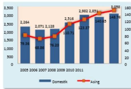
Figure 1: Graph Arrivals DIY 2005-2011