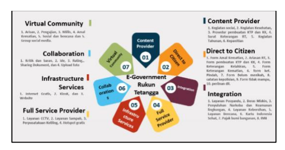
Figure 2. E-government Rukun Tetangga Model

society can be free from drugs. Proposition 7: E-Government of Rukun Tetangga must have the ability of virtual community to facilitate communication among residents in neighbourhood of RT.