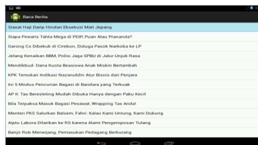
Fig. 3. List of news based on categories

News list page is a page that displays a list of news categories based on news or news based websites origin. On this page the user can click on a headline to read news if desired. Page list of news can be seen in Figure 3 and detailed news seen in Figure 4.