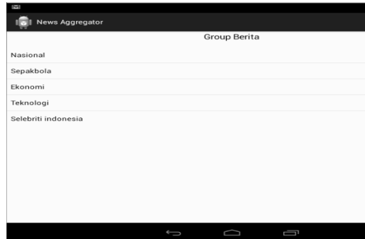
Fig. 1. Main page of news aggregator