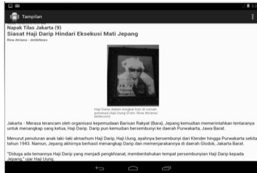
Fig. 4. Detail of news