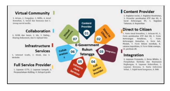
Figure 2. E-government Rukun Tetangga Model

society can be free from drugs. Proposition 7: E-Government of Rukun Tetangga must have the ability of virtual community to facilitate communication among residents in neighbourhood of RT.